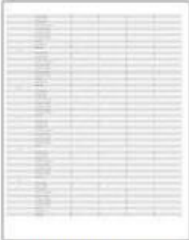
Sample Volume by Worksite