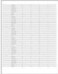
Samples With No Sampled Date