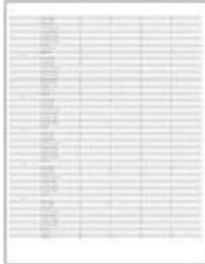
Sample Volume by Worksite by Component