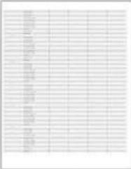
Transit Time Summary