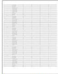
Unregistered Units and Components