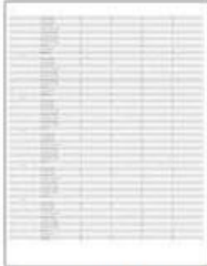
Samples With No Lube Age